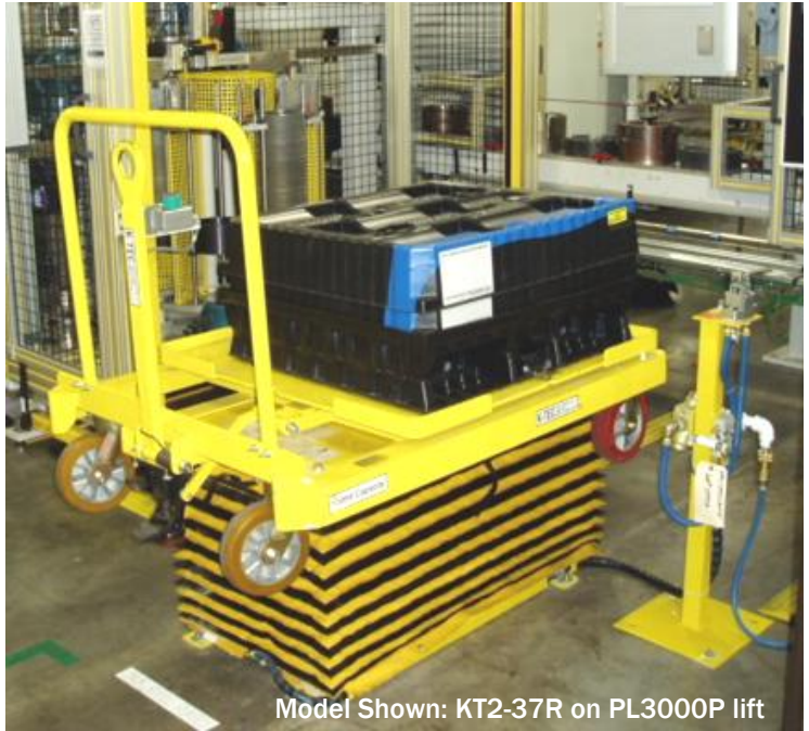
Model Shown: KT2-37R on PL3000P lift

K-Tec identifies and benchmarks relevant applications, addresses ergo/safety issues and provides on-site feasibility reviews where required. Application engineers are available by conference call or direct appointment to help walk through the early planning and front end design phase of lean material flow projects. 2