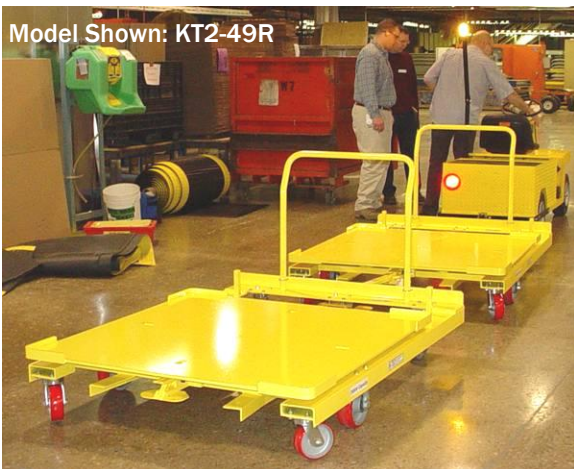
Model Shown: KT2-49R

K-Tec also designs ergo-support products such as lifts and conveyors to provide an integrated, dependable solution. A “try before you buy” demo program for qualified customers delivers a hands on look at a forklift free solution without wasting investment dollars.